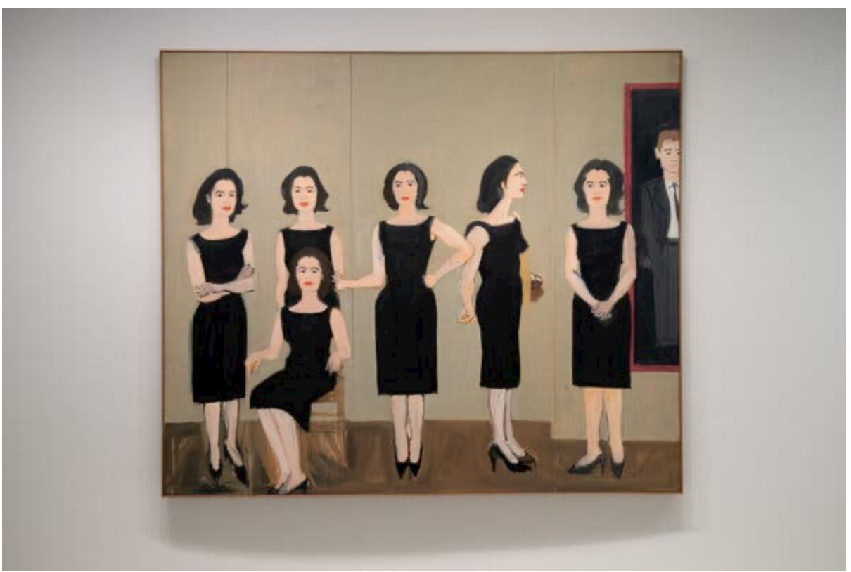
"The Black Dress" (1960), at the exhibition, 'Alex Katz: Gathering,' at the Guggenheim Museum.