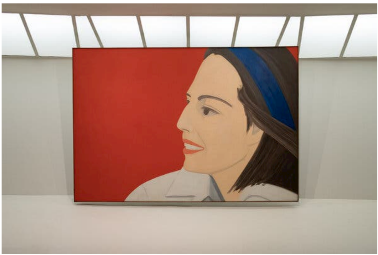
"The Red Smile," from 1963. Katz's portraits evoke the smooth aesthetics of advertising billboards and movies.

He would find his own way. He insinuated Pollock's all-overness into "Apple Trees" (1954) with daubs of color and scratchy lines for trunks and branches. In 1955, and for the next