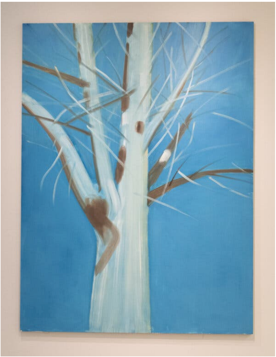
"Blue Tree 2," from 2020.