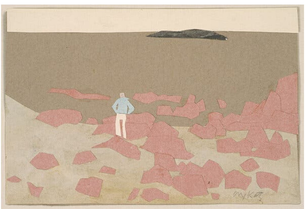
Alex Katz, "Untitled (At the Seashore)," 1958, watercolor and colored paper collage.Credit...Alex Katz/Licensed by VAGA at Artists Rights Society (ARS), NY; via Colby College Museum of Art