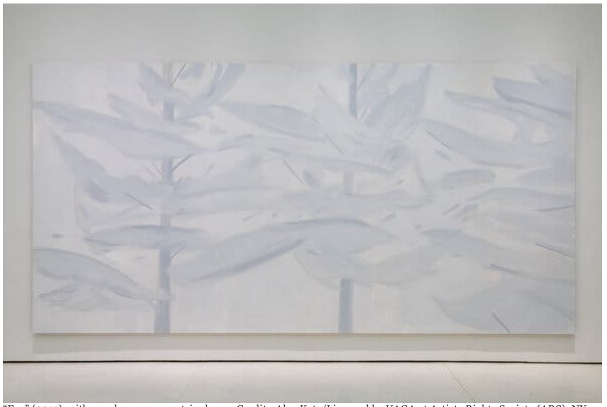
"Fog" (2015), with gray lozenges as outsize leaves.Credit...Alex Katz/Licensed by VAGA at Artists Rights Society (ARS), NY; George Etheredge for The New York Times

In "Fog," big, fat pale gray-on-gray lozenges present themselves as outsize leaves or pine branches. And in the awesome "Black Brook 16," nearly 30 feet long, horizontal and vertical clumps of paint in several tones of dark green and gray make it impossible to tell solid from reflection, up from down, large from small.