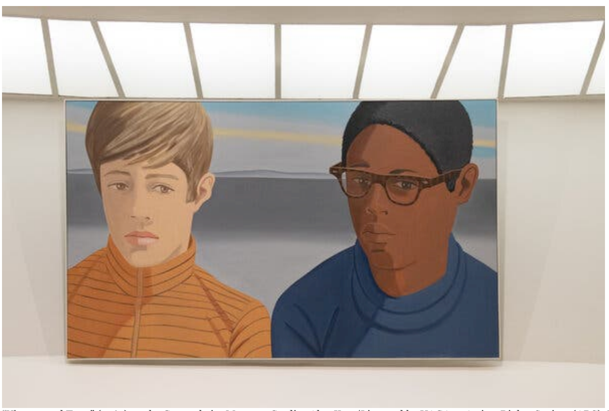
"Vincent and Tony" (1969), at the Guggenheim Museum.