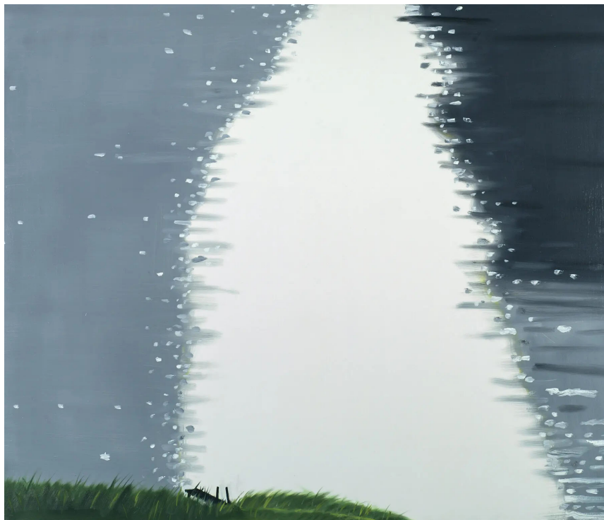
“Lake Light” (1992), a landscape of Maine, where Katz has been spending his summers painting since 1949.

and privileged.” The critic Peter Schjeldahl once described Katz’s subjects as “an ostensibly uptownish, upper-middle-class pageant of the suave, sexy and adorable” whose “effect is deemed as obnoxious as a club’s velvet rope.” Or, as Jafa puts it in his catalog essay: “Most people would think about Alex’s work within this incredibly narrow WASP register.” But Jafa argues that Katz is, in fact, working in a tradition of “Jewish artists rendering whiteness,” as has long been true of Hollywood filmmakers. And the nattily dressed people of Katz’s paintings weren’t necessarily rich — at the time, that’s how artists attired themselves. For years, Katz himself was working as a framer two or three days a week (and occasionally as a house painter) to support himself while living in a series of illegal, unheated cold-water lofts.