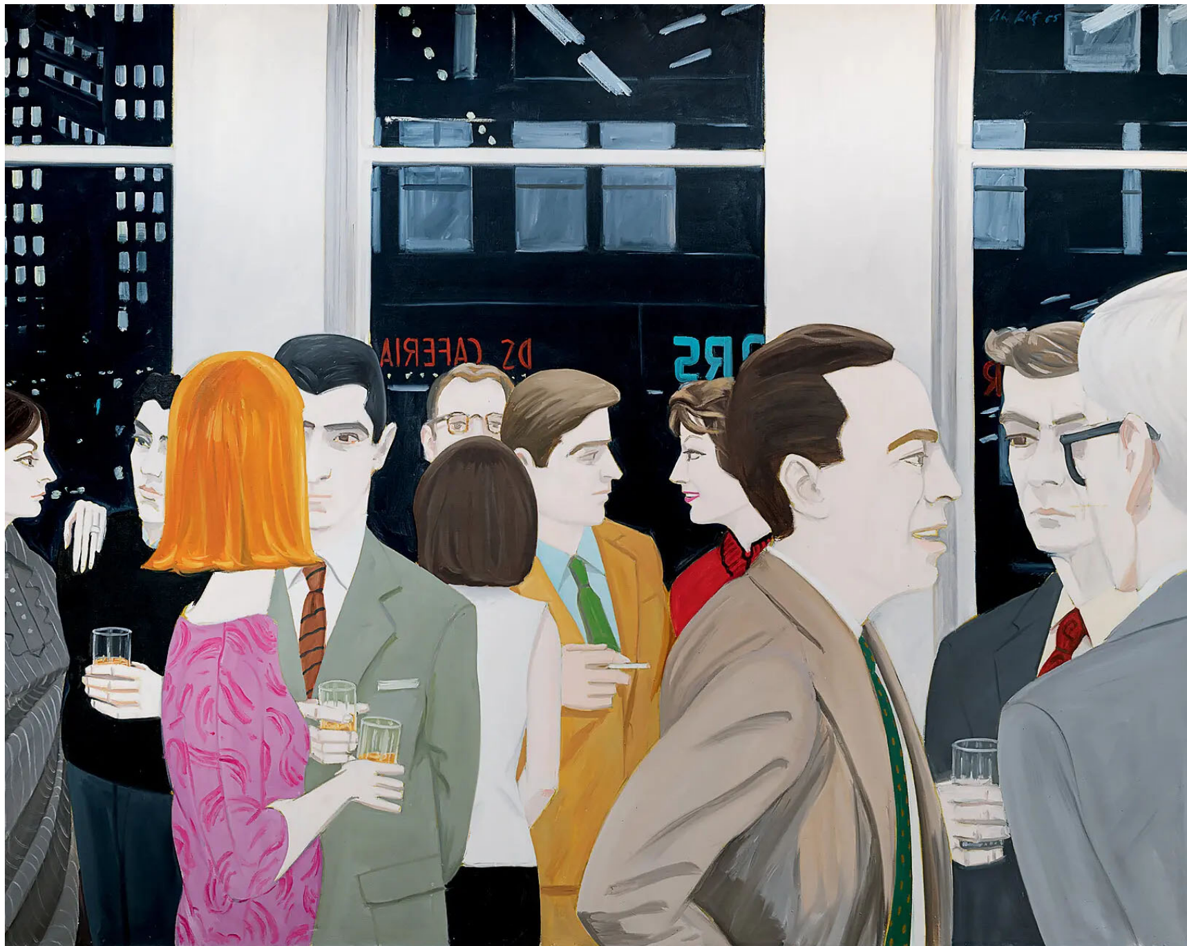
One of the artist's early group portraits, "The Cocktail Party" (1965). Photo by James Prinz, Chicago © 2022 Alex Katz/Licensed by VAGA at Artists Rights Society (ARS), New York