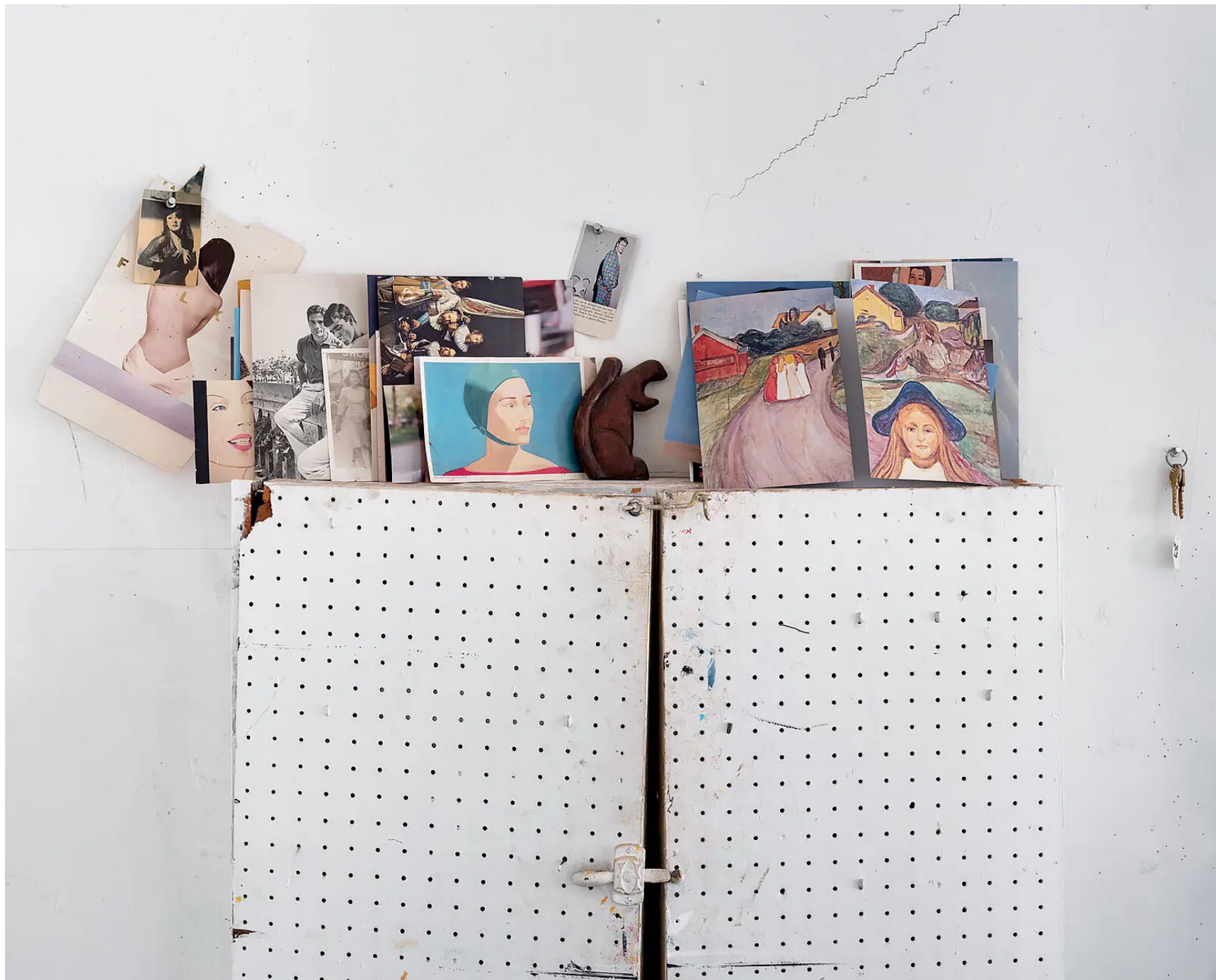
A few sources of inspiration atop a tool cabinet in the artist's studio. Alec Soth