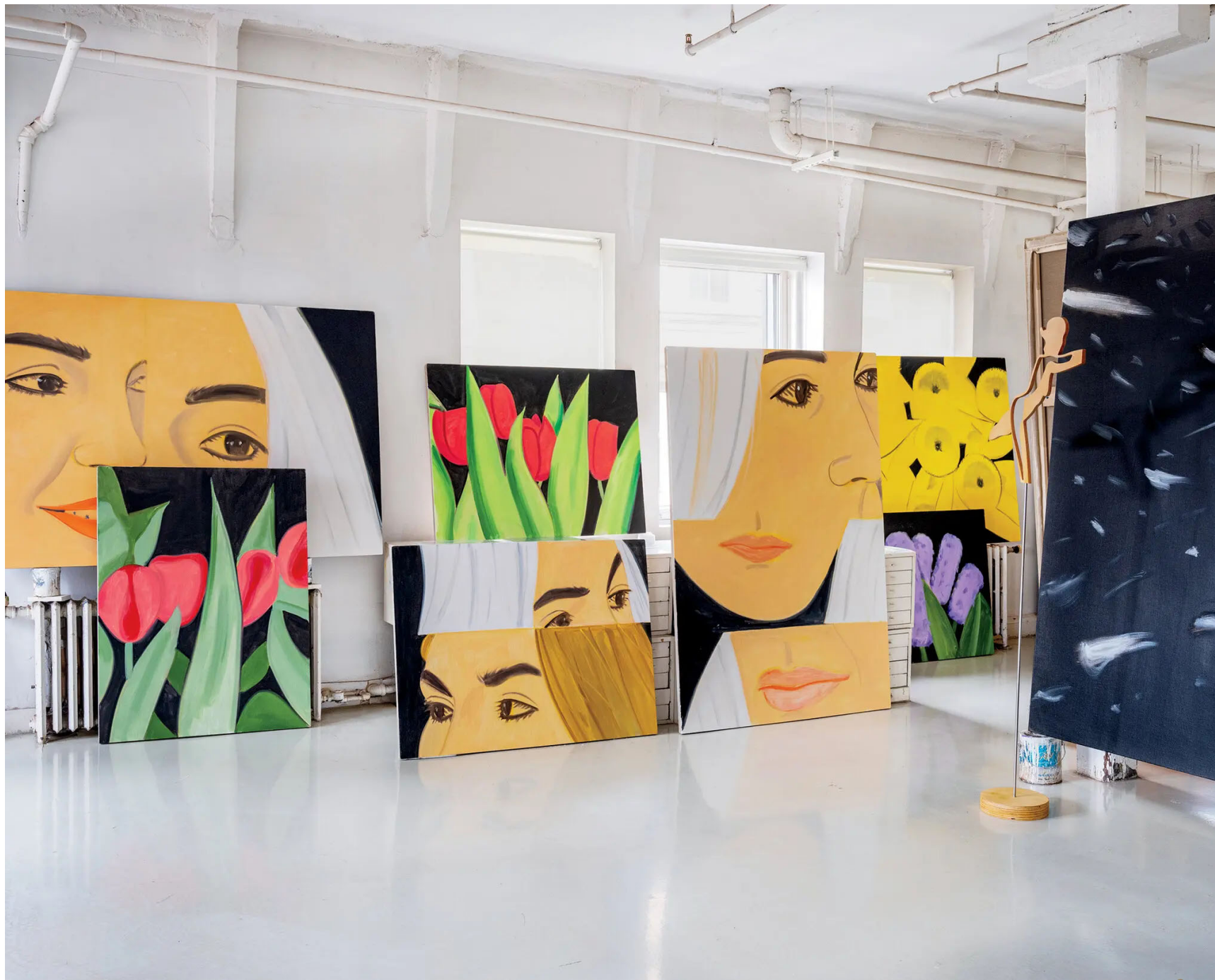
Works in Katz's SoHo studio include split portraits and flower paintings.